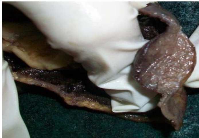
Fig. 1. A round polypoid mass was noted proximal to the intussusception

A thorough inspection was done to look for a Meckel's diverticulum, which was not found. However, a round polypoid mass measuring (20x20x5.5mm) was noted proximal to the intussusception (Fig. 1). On histopathology, ectopic pancreatic tissue was seen in the small bowel (Fig. 2).