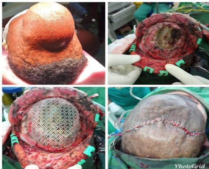
Fig. 3. Showing pre-operative (upper left) intra-operative (upper right and lower left) and post excision (lower right) photos of the tumour