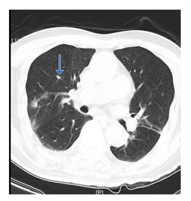
Fig. 2. CT Scan: On Day 1: There is a Heterogeneous irregular soft tissue density mass, measuring at least 5.5x4.3x5.2 mm (Arrow)

Fig. 1. Chest X-ray: Day 1: There is a 7 mm mass in the left upper lung field (Arrow). The figure also shows Lumbar spine instrumentations that stabilize the spine during fusion after corrective surgery for a back injury