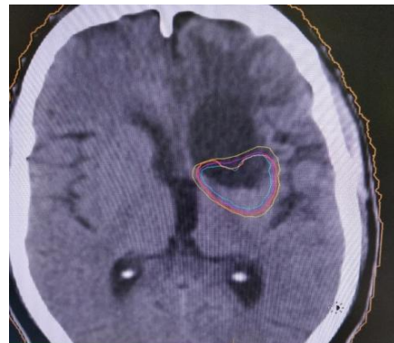
Fig. 1. Axial image of CT scan showing isodose curves, yellow line shows 85% coverage

frontal area 9 Gy in 5 fractions by IMRT technique. His MRI brain showed an ill-defined lesion measuring 0.5x 0.2 cm in the left putamen nucleus suspicious of residual lesion. In view of clinical improvement, he was further given consolidation chemotherapy with 2 cycles of cytarabine. Repeat MRI brain was done after 3 months which revealed an ill-defined altered signal intensity area measuring 0.5x 0.2 cm in the left putamen nucleus, showing diffusion restriction and mild post contrast enhancement, likely residual disease. In view of small residual disease, young age and good performance status, he was advised focal radiation by SRS technique. He was treated with linac- based SRS to the residual lesion to a mean dose of 13 Gy in single fraction at 85% prescription dose to the planning target volume (Fig. 1). The tumor volume was 16.89 cc. He was followed up with MRI brain every 3 monthly and the last scan done after 8 months post SRS showed no evidence of disease (Fig. 2a and 2b).