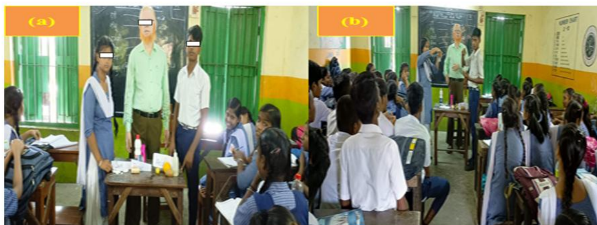
Fig. 3. Experimental group students learning the concept of acids, bases, and salts by verifying (a) taste and (b) indicator tests

Students acquired experiential learning joyfully and efficiently using the detective learning approach by receiving desirable assistance from the teacher (here, the investigator). The role of the teacher during the activities was that of a facilitator and guide, and he created an attractive learning environment in the classroom to ensure quality learning in physical science. Activities were self-performed by the students of the experimental group in the classroom with necessary assistance from the teacher; very few of these have been given in Fig. 3.