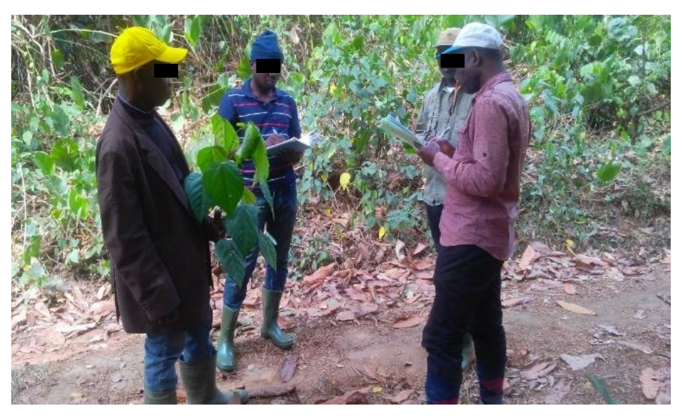
Fig. 2. Plant identification and collection

Both herders and traditional practitioners defined diarrhoea as fluid and repeated stools. In case of diarrhoea, farmers give the leaves to the animals as food. For humans, in case of diarrhoea, plants (leaves, bark and/or roots) are mostly used as decoction and oral administration remains the most frequent way of administration of plant recommended by healers.