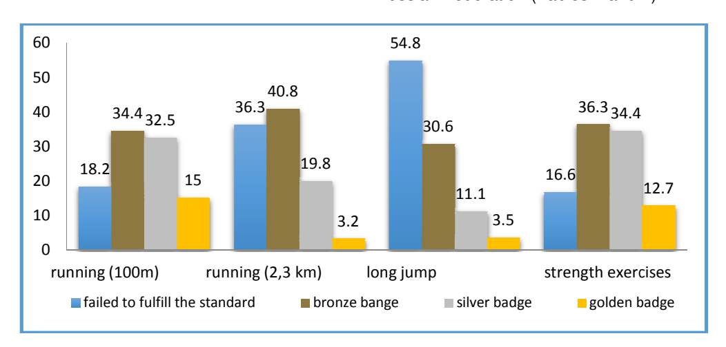
Fig. 1. The results of the exercises of the "Ready for Labor and Defense" programme, done by the students

The results of our own researches were compared to the results of the all-Russian tests [19] which were carried out by The scientific and methodical council on physical culture and sport at the Ministry of Education and Science of the Russian Federation (Tables 1 and 2).