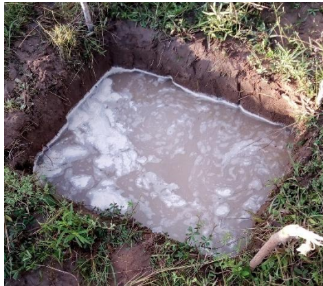
Fig. 7. Soil pit with one horizons