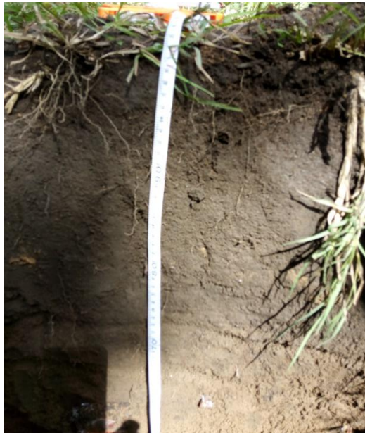
Fig. 6. Soil pit with three horizon