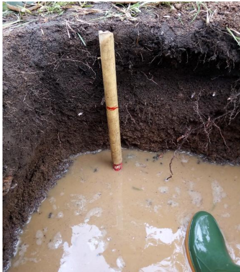
Fig. 5. Soil pit with two horizons