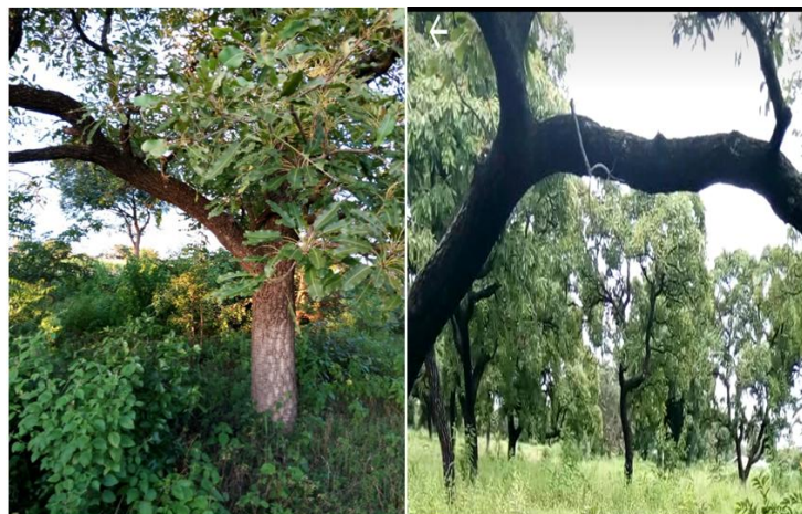
Fig. 2. Shea woods and park

The Nakele site (1.44 m) has the highest girths than the other sites Gnarkèradouo (1.15 m) and Assoum 2 (1.26 m).