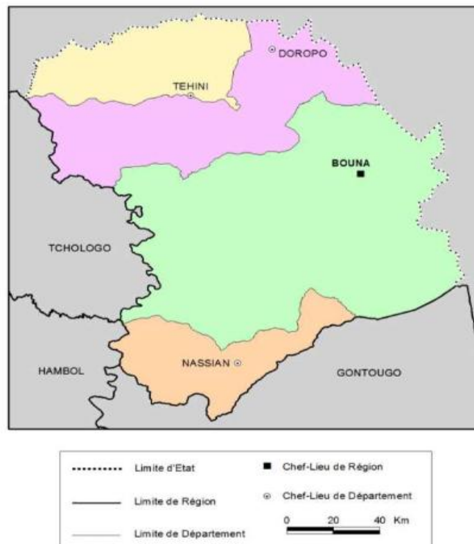
Fig. 1. Map of study site

Located in a savannah zone dominated by grass and trees, the Boukani climate is Sudanese with two major seasons, one rainy from June to October (4 to 5 months) and the other dry from November to February (7 to 8 months). The main activity in the area is agriculture, which includes the cultivation of Kponan yams, for which the area is famous, cereals (corn, sorghum and millet), and more recently cashew farming. The Boukani is drained by the Comoé and the Volta Noir (Fig. 2), which favors market gardening. Trade and transportation are not forgotten. The area is also known for its mineral-rich subsoil, particularly gold, which is mined by illegal miners. Livestock farming is an important part of this economy, with poultry, cattle and goat breeding. The Tourism, in particular the Comoé National Park founded in 1968, is also a source of foreign currency. With its surface area (1 150 000 ha), this park is the oldest and most important in Côte d'Ivoire.