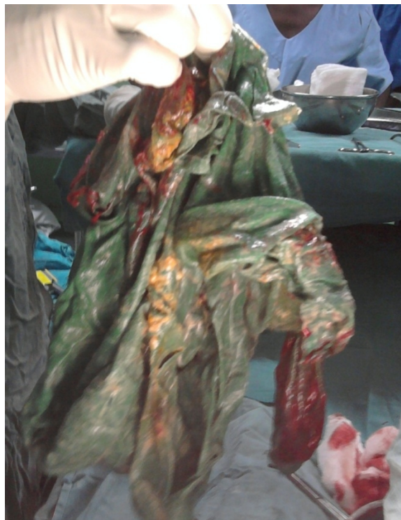
Fig. 2. The retrieved surgical linen.