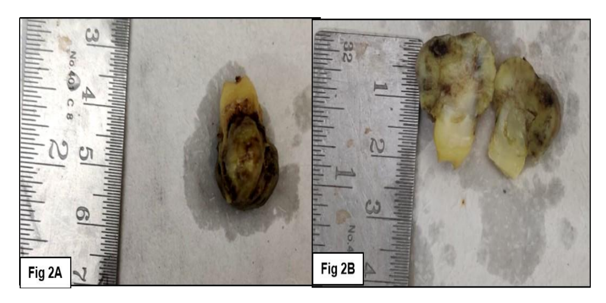
Fig. 2A. Gross examination showing hard tissue bit of bony hard mass surrounding the tooth 2B. Decalcified sliced sections showing tumor mass attached to the roots of permanent molar