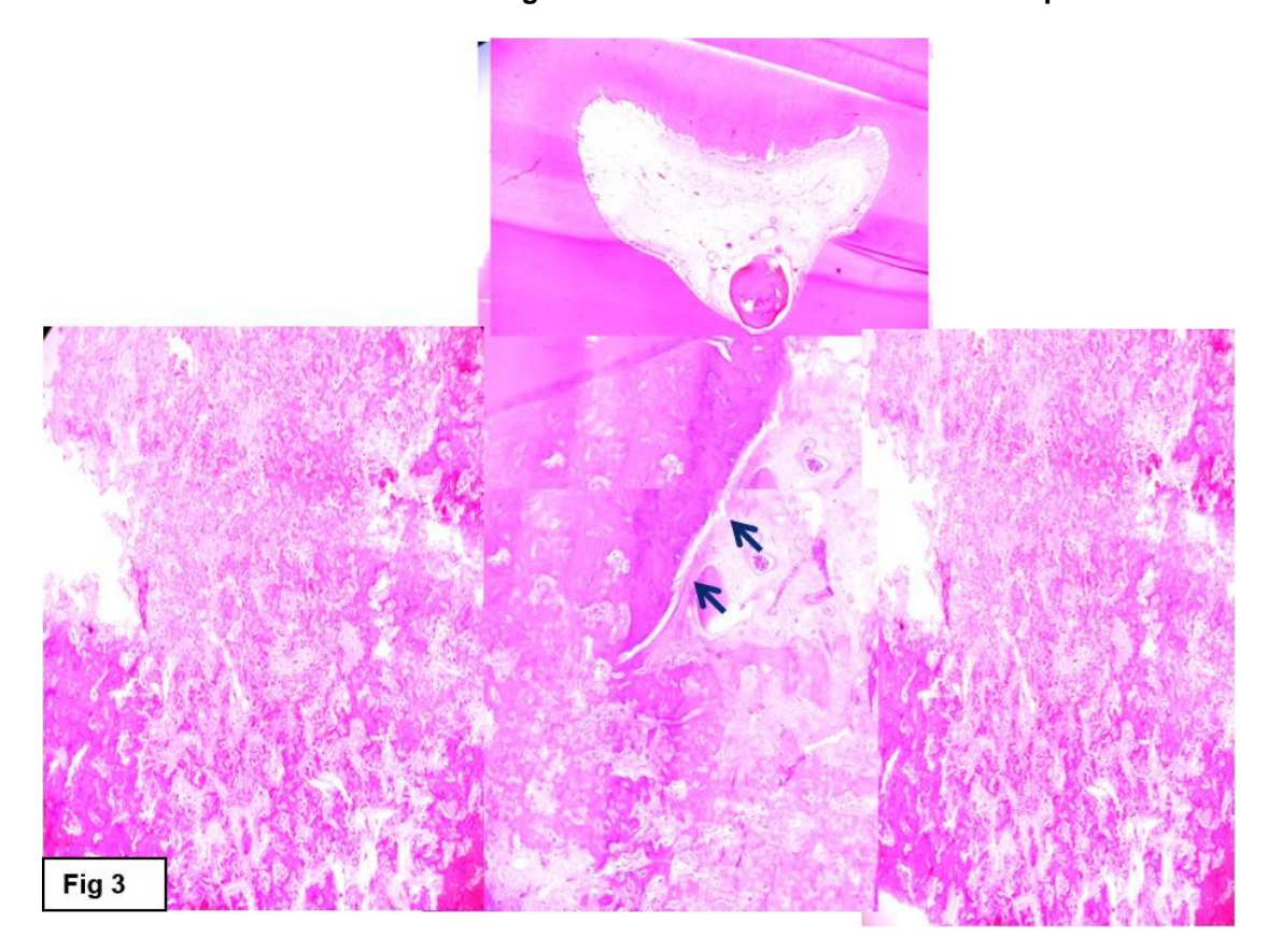
Fig. 3. Photomicrograph showing tumor mass attached to the apical portion of tooth (HE 40X) Arrow heads (blue) delineating the junction between the tooth and the cemental mass