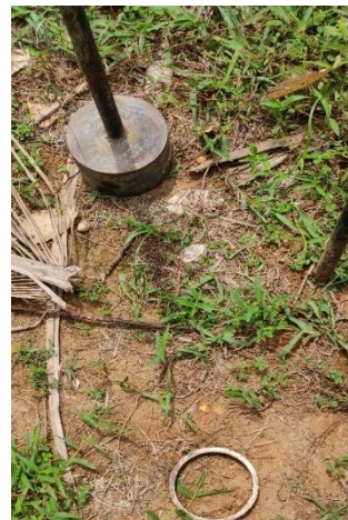
Fig. 2. Soil bulk density measurement by core cutter method