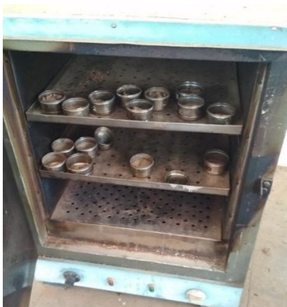
Fig. 1. Soil moisture content measurement by oven drying method