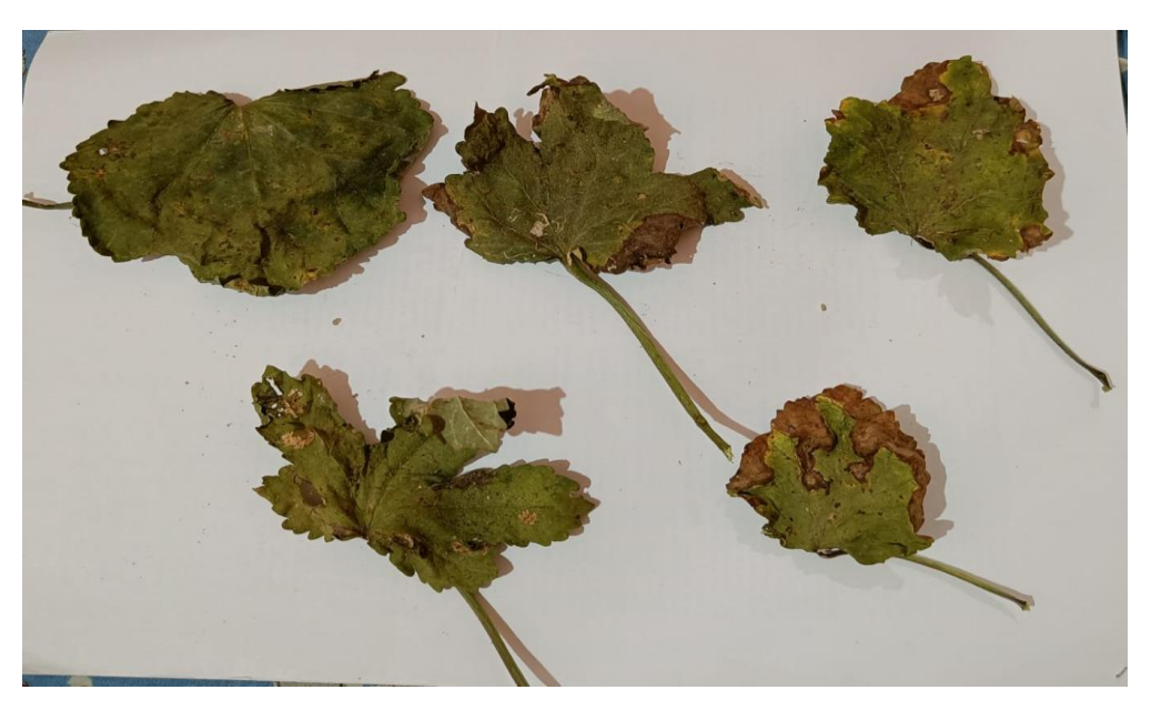
Fig. 1. Overview of Disease Infested Leaves