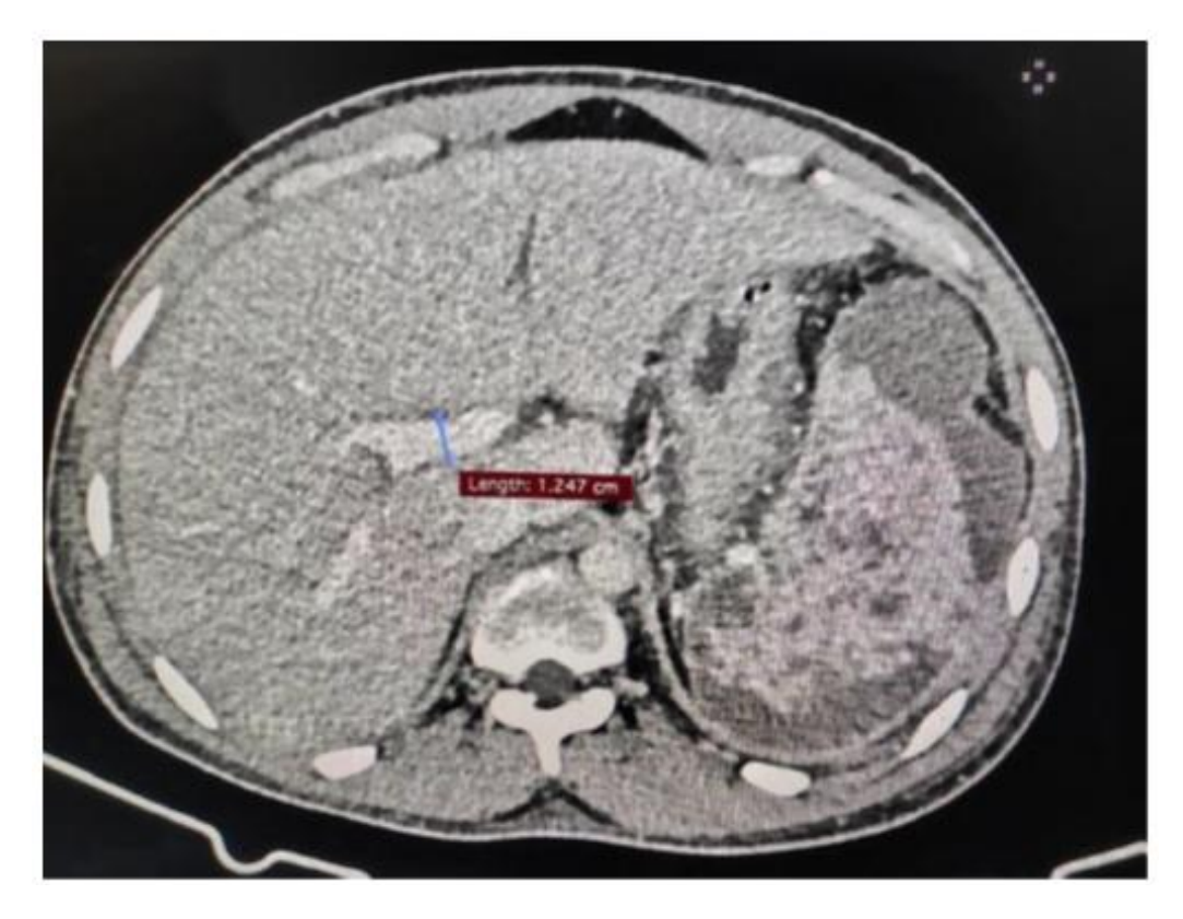
Fig. 5. CECT showing normal portal vein caliber and liver density. No evidence of thrombus and surface irregularity

According to Tonolini et al, splenic rupture can be with or without hemoperitoneum and acute abdominal manifestations. Young age patients with acute infection suggest an atraumatic splenic rupture [7]. Non-traumatic splenic rupture (NSR) may result from an infection of connective tissue and malignancies in infections like mononucleosis, malaria, typhoid, endocarditis, aspergillosis, and dengue [8]. NSR can be pathological or spontaneous. Silva et al hypothesized that a combination of coagulation factors and thrombocytopenia contributes to causing splenic rupture [9]. In the majority of cases, splenic rupture occurs in the viremic phase of dengue, that is, before the development of antibodies in the presence of antigen.