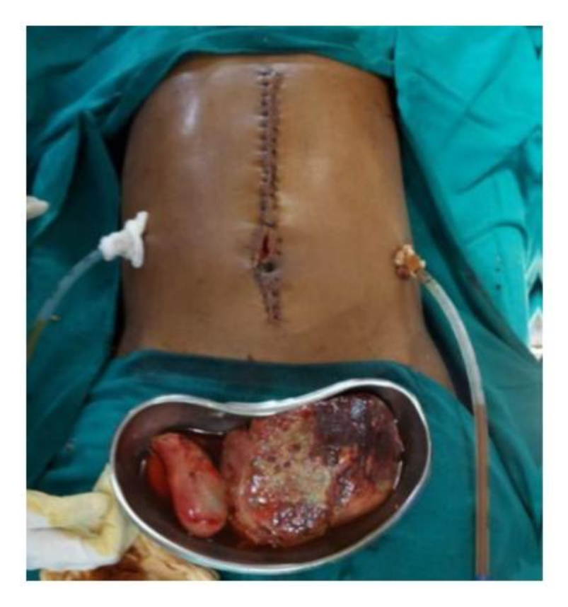
Fig. 2. Exploratory laparotomy in mid-vertical line incision showing spleen and gall bladder

Fig. 1. CECT abdomen showing multiple hypodense non-enhancing areas in the spleen predominantly in the upper pole with peri splenic hematoma