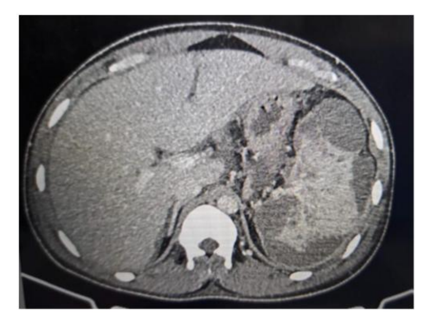
Fig. 1. CECT abdomen showing multiple hypodense non-enhancing areas in the spleen predominantly in the upper pole with peri splenic hematoma

are found in 15% of necropsies. However, a splenic rupture in dengue infection is extremely rare, and only a few cases have been reported in the literature.