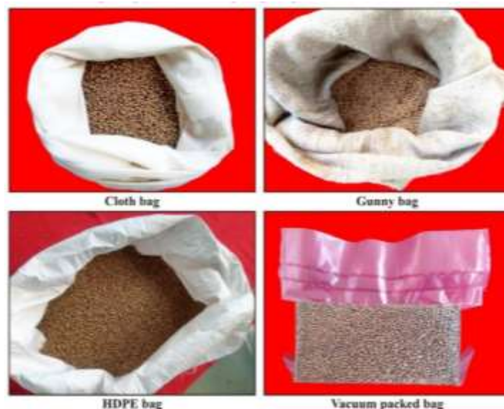
Fig. 1. Different packaging used for moth bean storage