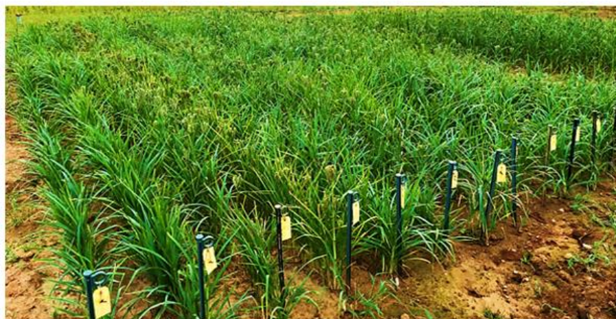
Fig. 1. Control plots at reproductive stage of 20 finger millet genotypes during preliminary screening

The land was ploughed once with disc plough followed by two harrowing to bring the seedbed to fine tilth. The stubbles and weeds were collected and disposed to facilitate sowing. During layout, small bunds were provided all around each plot and between irrigation channels and the land within each individual plot was leveled manually to maintain uniform irrigation water application. The recommended dose of 50:40:25 N, P 2 O 5 , K 2 O kg ha -1 was applied in split dose. NPK was applied in the form of urea, di-ammonium phosphate and muriate of potash, respectively. Half of the recommended dose of nitrogen and full dose of P and K was given as basal dose at the time of transplanting and the remaining 50 per cent N (urea) was provided as top dressing at 35-40 DAS. Irrigation was provided to the control plots (No stress plots) at regular intervals of once in 3 days to maintain the adequate field capacity so as to maintain the crop without any stress. For induction of stress to the plots at reproduction stage moisture was withheld for 15 days. The crop was harvested at maturity as the ear heads turned brownish colour coupled with straw turned to yellowish colour to ground level separately and dried for a week before recording the weight. The grains were cleaned, dried and weight was recorded at less than ten per cent moisture content and finally values were converted to per hectare basis.