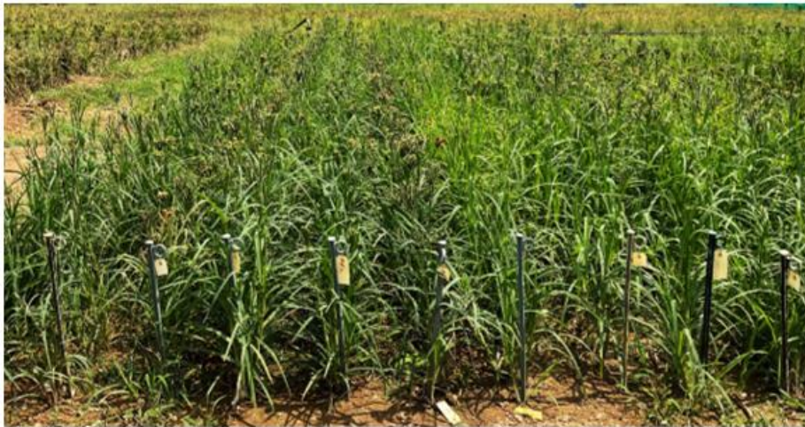
Fig. 2. Water stress imposed plots at reproductive stage of 20 finger millet genotypes during preliminary screening