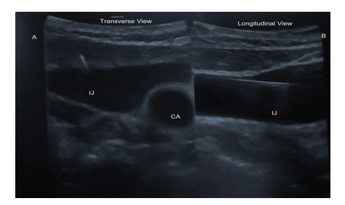
FIGURE 4: Real-time biplane view of the guide wire during central venous cannulation in our patient. The guidewire is visible in the lumen of the IJ in both views. IJ: internal jugular vein; CA: carotid artery.