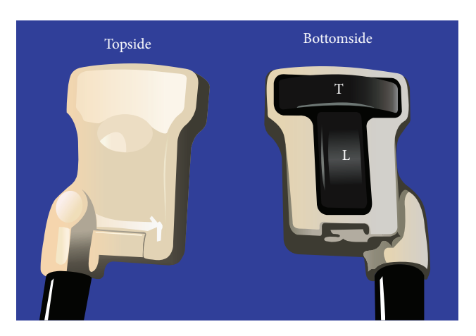
FIGURE 1: A pictorial depiction of the BK 8824 US probe showing the configuration of the transverse and longitudinal transducers. T: transverse transducers; L: longitudinal transducer.