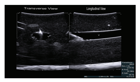
FIGURE 2: Images from our use in a Blue Phantom training phantom with an 18 gauge 40 millimeter VascularSono cannula (Pajunk USA, Norcross, GA). This is the ideal view that can be obtained with this probe. You can clearly see the needle entering the simulated vein in both views, and the tip is clearly in the lumen in the longitudinal view. V: simulated vein.