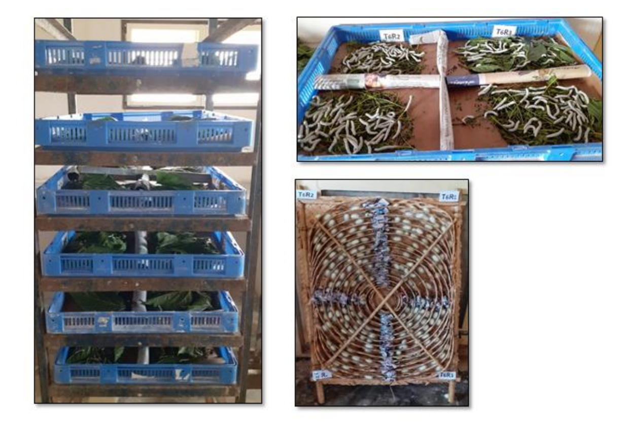
Plate 2. General view of silkworm rearing (PM × CSR<sub>2</sub>)