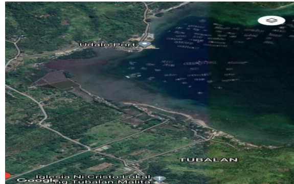
Fig. 1. The Map of Tubalan Cove, Malita, Davao Occidental showing the location of the study sites ( www.google.com/map )

Occidental, particularly Sitio Agdao of Brgy. Tubalan, Sitio Baybay of Brgy. Buhangin and Sitio Lahusan of Brgy. Fishing Village, Malita, Davao Occidental.