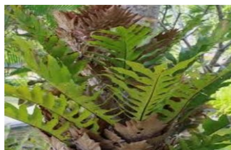
Plate 2. Aglaomorpha quercifold