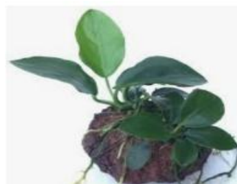
Plate 3. Anubias barteri

Baybay station exhibited 3 mangrove-epiphytic plants species namely Anubias barteri , Microsorium pteropus and Asplenium midus . The most common species that can be found in all plots was Anubias barteri with relative abundance of 46%.