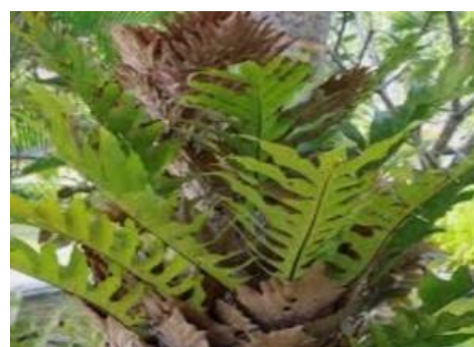
Plate 4. Aglaomorpha quercifold

Among 3 stations, Sitio Lahusan has the most numbered of mangrove-epiphytic plants with 4 species identified ( Imprerata cycindrica , Aglaomorpha quercifold , Microsorium pteropus , and Davalia denticulata ). Of these mentioned species, Aglaomorpha quercifold still exhibited as the most abundant with 54%. In this station, the species of Imprerata cycindrica can be noticed, in which this cannot be found in other 2 stations.