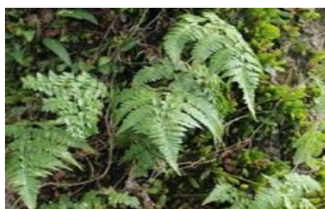
Plate 1. Davalia denticulata

Results of the study shows that species of mangrove epiphytes in the study area composed of 3 to 5 species per station and exhibit 1 to 3 identified species per plot. The species of Davalia denticulata and Aglaomorpha quercifold were the most common species of mangrove-epiphytic plants in the Agdao Station with relative abundance higher than 50% followed by Asplenium midus in 33.33%.