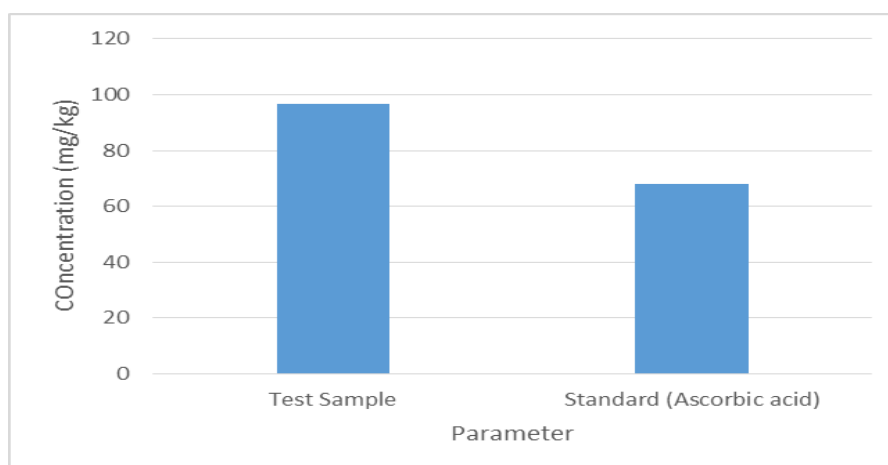
Fig. 2. Graphical representation of Total Antioxidant Capacity (TAC) of Persea americana compared with ascorbic acid as a standard

Values are mean of duplicate determination