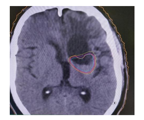
Fig. 1. Axial image of CT scan showing isodose curves, yellow line shows 85% coverage

frontal area 9 Gy in 5 fractions by IMRT technique. His MRI brain showed an ill-defined lesion measuring 0.5x 0.2 cm in the left putamen nucleus suspicious of residual lesion. In view of clinical improvement, he was further given consolidation chemotherapy with 2 cycles of cytarabine. Repeat MRI brain was done after 3 months which revealed an ill-defined altered signal intensity area measuring 0.5x 0.2 cm in the left putamen nucleus, showing diffusion restriction and mild post contrast enhancement. likely residual disease. In view of small residual disease, young age and good performance status, he was advised focal radiation by SRS technique. He was treated with linac- based SRS to the residual lesion to a mean dose of 13 Gy in single fraction at 85% prescription dose to the planning target volume (Fig. 1). The tumor volume was 16.89 cc. He was followed up with MRI brain every 3 monthly and the last scan done after 8 months post SRS showed no evidence of disease (Fig. 2a and 2b).