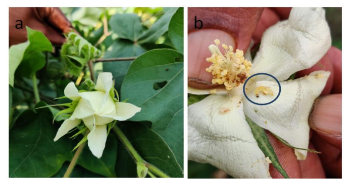
Plate 1. PBW damage to the flowers of Bt cotton. (a) Rosetting of infested flower (b) Infested flower showing feeding damage and PBW larva (inside the circle)

Of late, higher incidence levels were being observed on flowers. This may be mainly due to cotton cultivation during summer months by a more significant number of farmers, long term storage of raw cotton in ginning mills and market yards [13]. The present study indicated that increased PBW incidence in flowers (around 15%) paves the way for more PBW's second-generation population. This enhanced population buildup would cause havoc to the bolls during the later part of the season. Earlier studies [14] also indicated PBW incidence on Bt cotton (65 DAS -75 DAS) in different districts of Gujarat. Pink bollworm infestations was observed in flowers of different Bollgard II hybrids ranging from 1.32% in Surendranagar to 34% in Junagadh on various Bt cotton hybrids. The highest pink bollworm infestation on rosette flower was observed in Junagadh, Rajkot, and Ahmedabad.