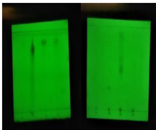
Fig. 1. Spots under the UV light (254 nm) of the ethanolic extract samples (left) and ethyl acetate-extracted samples (right); for each plate, from left to right, S1 (WG powder), S2 (BG powder), S3 (CSG), S4 (onion powder)