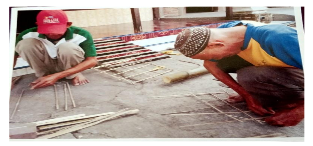
Fig. 2. The process of making the ancak

symbols of heirlooms. Some of the meanings of the symbols are as follows: