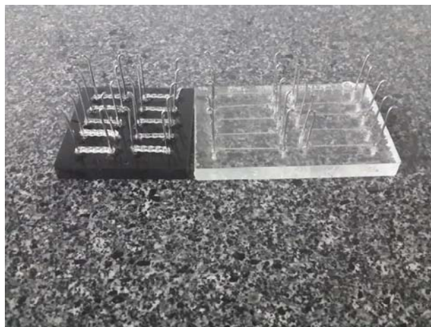
Figure 1. Plastic blocks with stainless steel pins (a). Digital force gauge and its stand (b).

In the case of artificial saliva, the samples were immersed in artificial saliva solution and stored in an