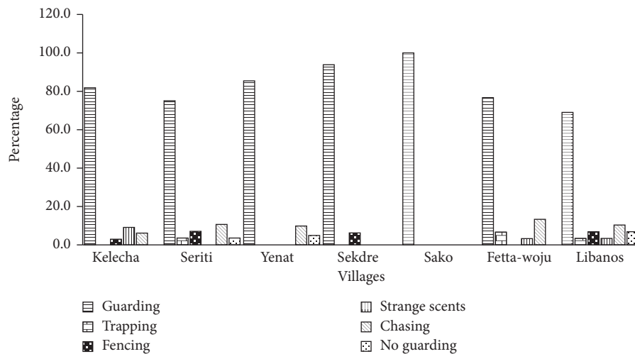
FIGURE 2: Different types of traditional techniques used by respondents in different villages around BSNP.

underlining mechanisms that trigger human responses are dependent on resources and perception of risks based on the nature of the interaction with the animals [24]. These threats of humans and damages to resources need to be reduced by developing resources protection measures, accurate and rapid verification of damages, and compensation schemes as a mitigation strategy to economic impacts [24, 25].