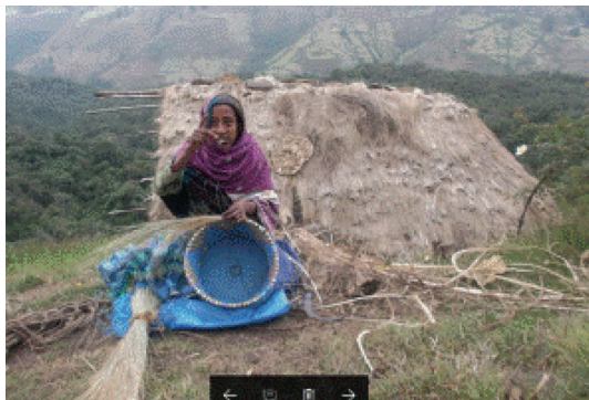
FIGURE 3: A girl guarding cropland against wild animals along with handcrafting in BSNP.