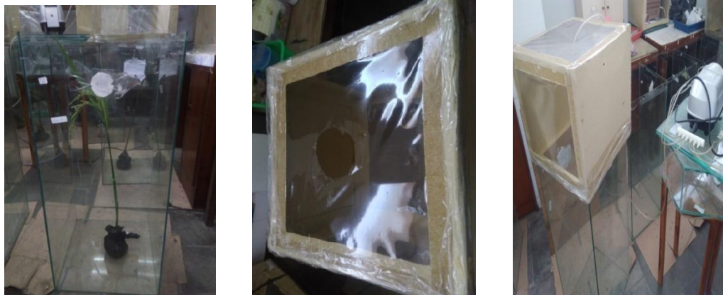
Fig. 3. Detail of the second modified Olfactometer. From left to right – Cage with rice plant, the hole bottom of cardboard as glass cover replacement, connection of cage, covers and aerators