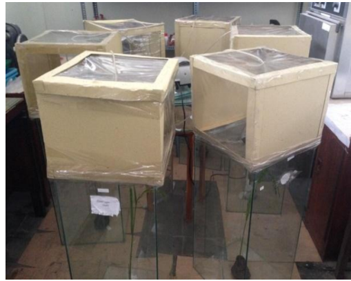
Fig. 2. Second modified olfactometer