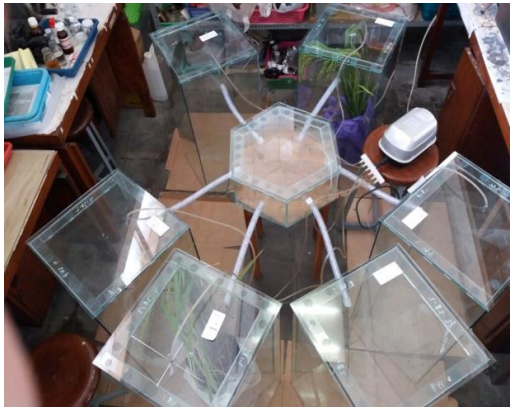
Fig. 1. First modified olfactometer