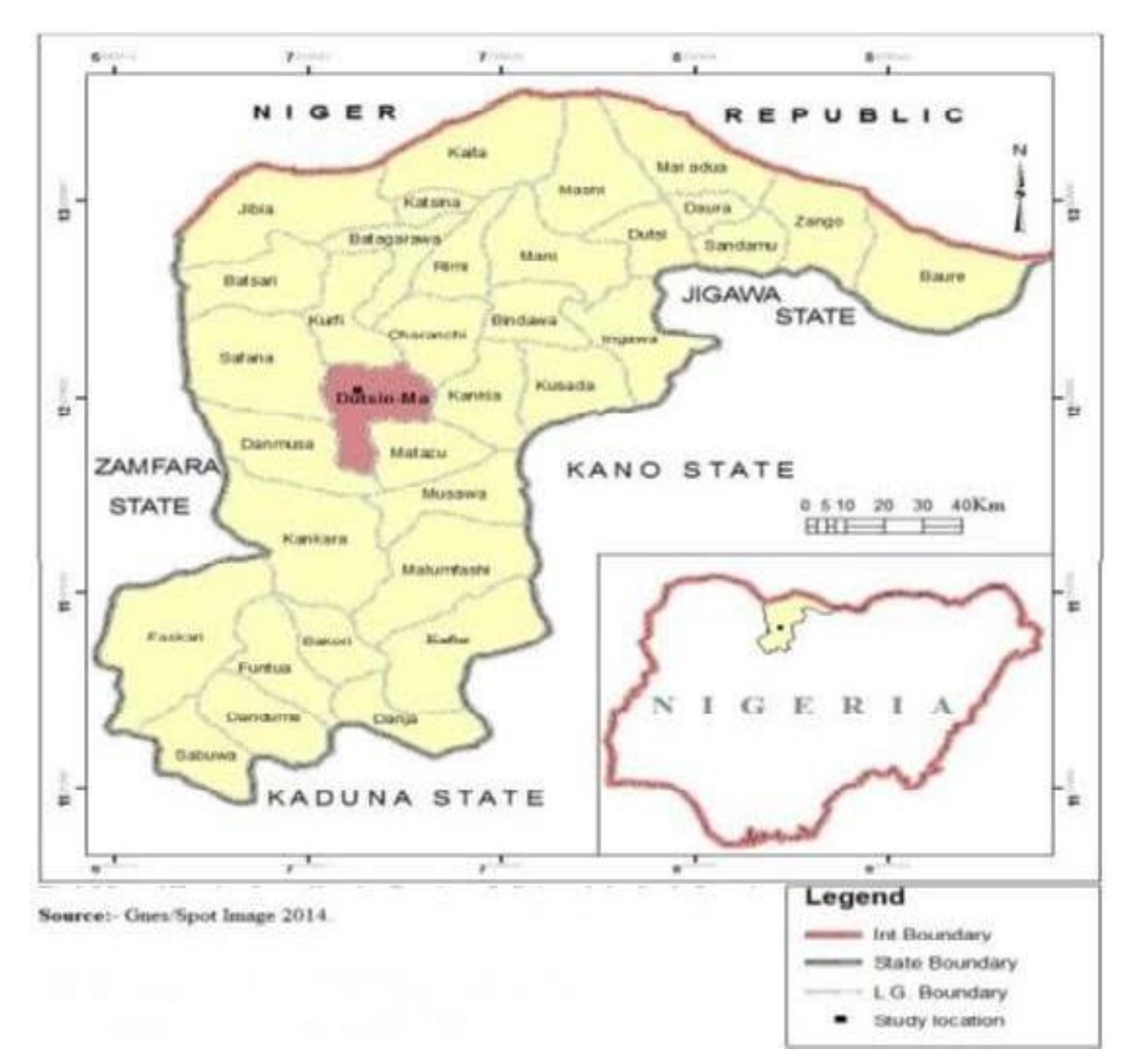
Fig. 1. Map of Study Area

The method developed by the United State Environmental Protection Agency (USEPA) 3005 was adopted for sample digestion. The samples were digested in a beaker covered with a watch glass by adding 1 mL of 70- 80 % concentrated HNO<sub>3</sub> and 2.5 mL of about 40% concentrated HCl and heated at 90 °C using a hot plate for 30 minutes. The beaker was then removed and cooled. Each of the digested water samples was filtered through Whatman filter paper into a 100