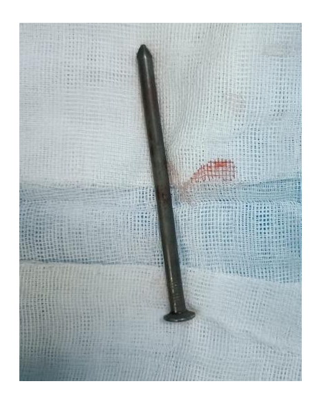
Fig. 3. The metalic nail

attempted first" [6]. "In case where endoscopic management failed or is not possible, open surgery is recommended external urethrotomy" [7].