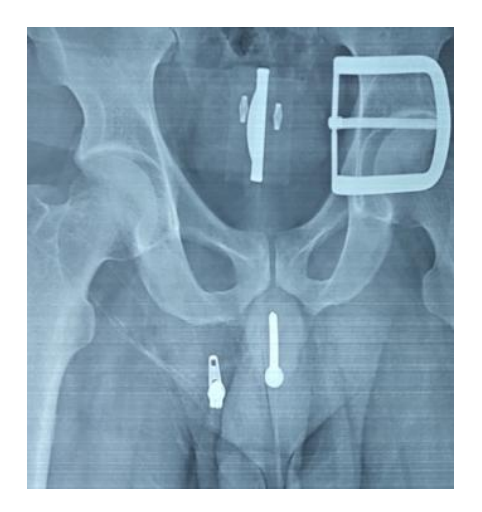
Fig. 1. X-ray pelvis

"Diagnosis is most often confirmed on physical examination. A pelvic X-ray and computerized tomography of the pelvis can be useful in defining a foreign body's position, orientation and contact with surrounding viscera" [4]. However, urethrocystocopy remains an excellent tool for the diagnosis of urethral foreign body.