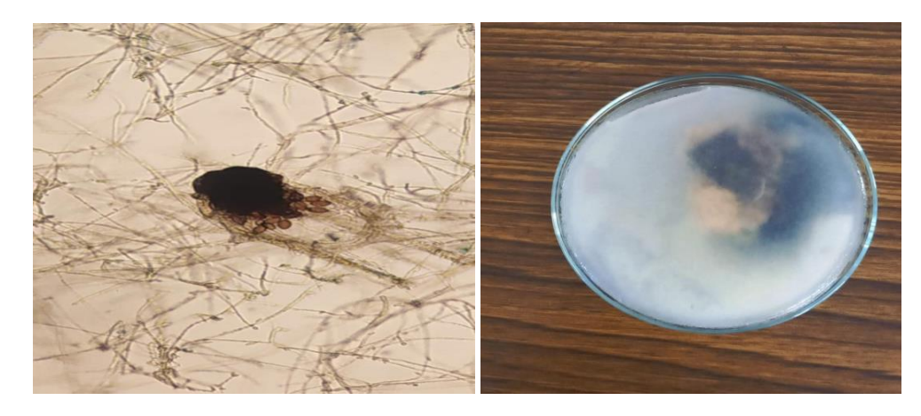
Fig 1A. Pathogen under light microscope,dark- brown walled, single septate Fig 1B. Upper surface of Pathogen colony and branched mycelium growth ( Botryodiplodia theobromae )