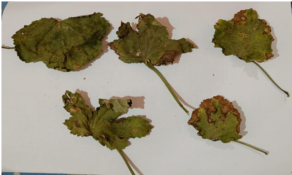
Fig. 1. Overview of Disease Infested Leaves