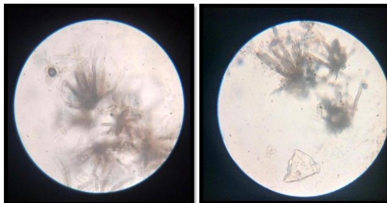
Fig. 2. Overview of microscopic view of Cercospora sp.