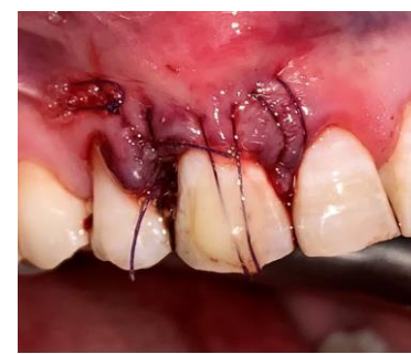
Fig. 6. Flap coronally anchored with composite button