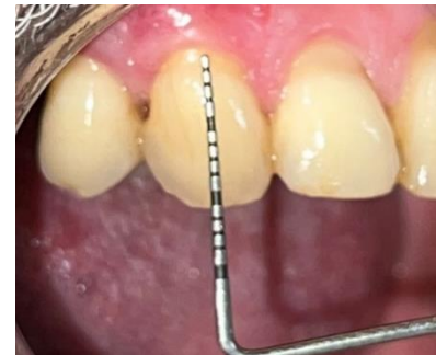
Fig. 12. Post operative site