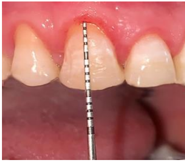
Fig. 7. Post operative view