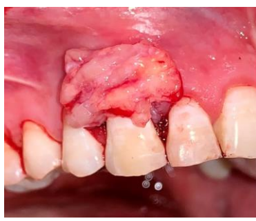
Fig. 5. Connective tissue graft placed at recipient site