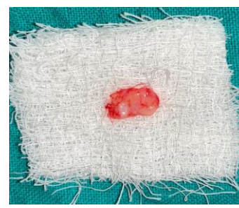
Fig. 3. Procured connective tissue graft