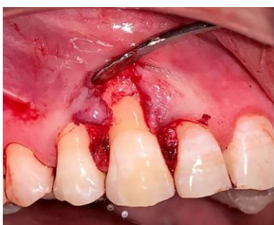
Fig. 4. Reflection at recipient site