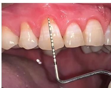
Fig. 1. Pre operative site

Gingival recession coverage was evaluated on the basis of 1. post operative recession length (RL), 2. % gain in root coverage (RC%), and 3. Percentage increase in width of keratinized gingiva (WKG%). RL at 1 and 3 months for CTG was recorded to be 1mm and RL at 1 and 3 months for Periocol was also 1mm. RC% and WKG% for periocol was 66.66% and 25% respectively at both 1 month and 3 months and it was 50% and 25% respectively in CTG at both 1 and 3 months.