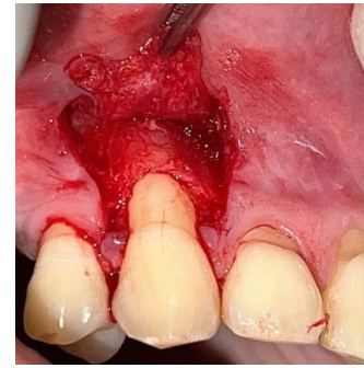
Fig. 9. Reflection at recipient site