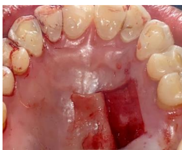
Fig. 2. Trapdoor epithelial flap reflected