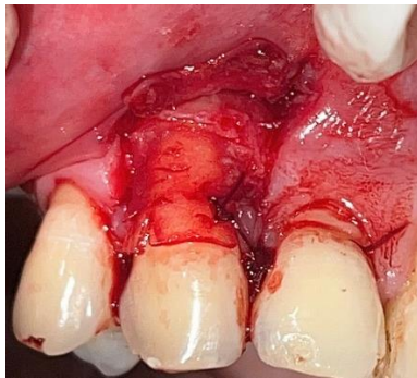
Fig. 10. Periocol® membrane placed and sutured