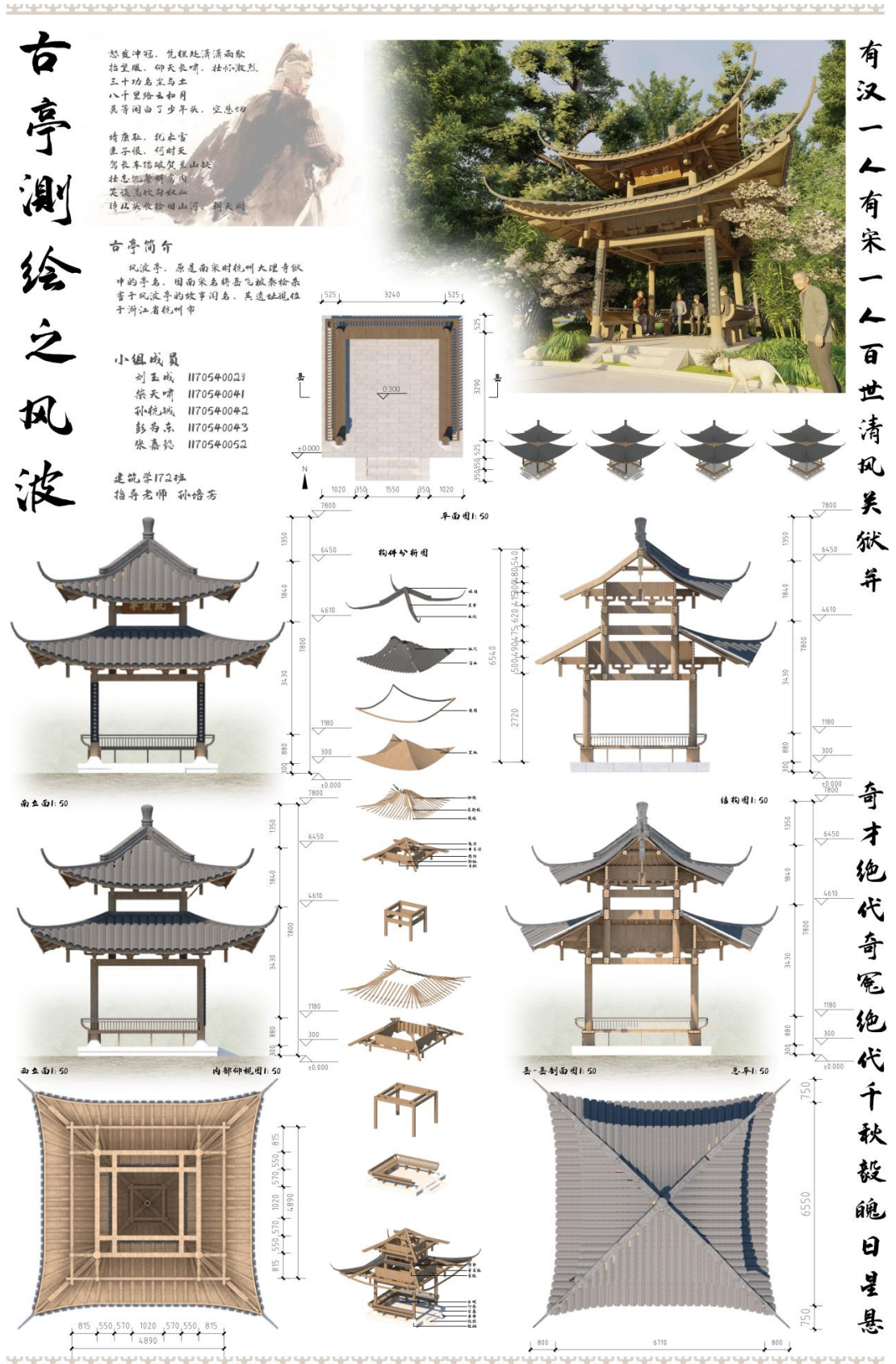
Figure 1. “Feng Bo Ting” pavilion.