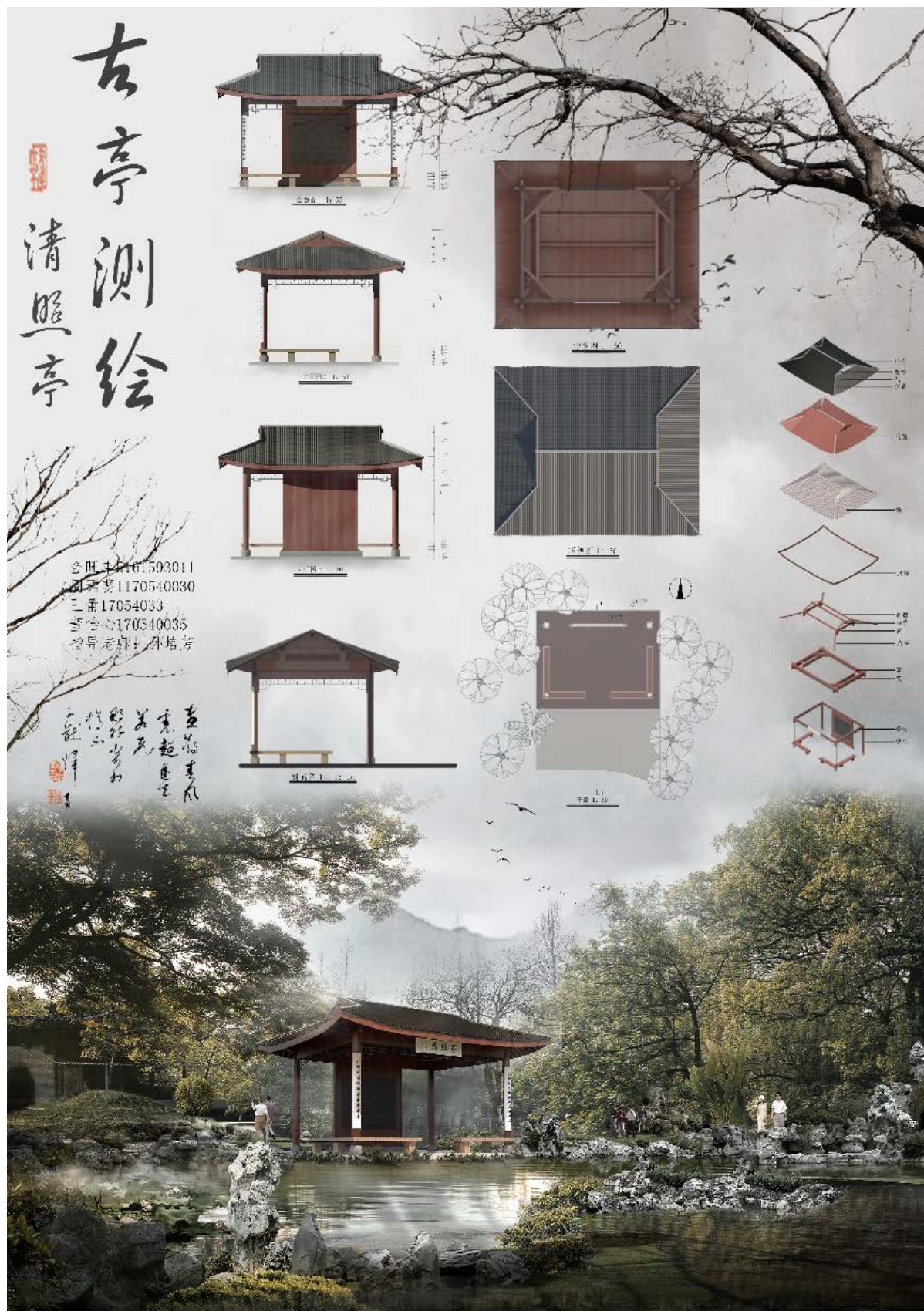
Figure 2. "Qing Zhao Ting" pavilion.