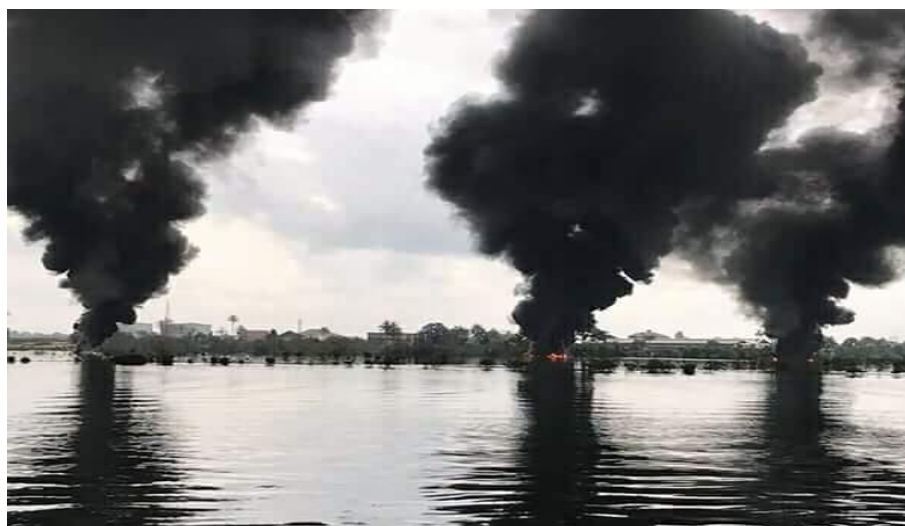
Fig. 1. Soot Pollution in the study area and environs