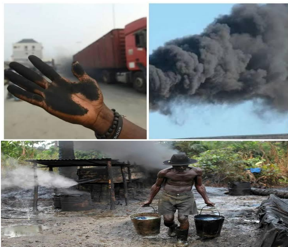
Fig. 2. The unregulated refinery at Rumuolumeni study location

Based on the investigation of Weli and Adekunle (2014), they were able to establish a strong correlation between air pollution, including soot, and morbidities like respiratory diseases, traumatic skin, outgrowth and respiratory health conditions, child deformities, stillbirth, and miscarriage in their study of environmental risk factors and hospital-based cancers in two Nigerian cities. Also, Yakubu [13] asserts that data from much research links those who are frequently exposed to contaminated air to health concerns such as skin and eye disorders. A similar relationship between man and nature has been proven by Yakubu even Humanist Eco marxists like Clark. In particular, this theory asserts that there is a link of interdependence between man and the environment. In particular, this theory asserts that there is a link of interdependence link between man and his environment. The Rift theory, which views the relationship as dynamic and the dynamics between people and non-humans in the natural world-which, although they are separate entities, are connected inside one metabolic system-further emphasizes this feeling of the intimate affinity between nature and man stated that, compared to Ibadan, Port Harcourt has a greater prevalence of skin and lung malignancies. In