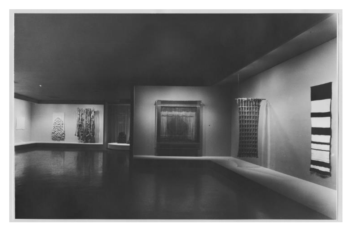
Note. Wall Hangings at Museum of Modern Art. Feb 25–May 4, 1969. Curated by Mildred Constantine and Jack Lenor Larsen. CC0 Public Domain Designation

Benefits of hand papermaking outside of the environmental ones include the artist's ability to manipulate factors on a minute scale to create unique results. Manipulations may result in a change in ink absorption ability, texture, grain appearance, coloring, and many other methods. similar to textile fiber art, papermaking can incorporate other non-fiber materials either into the fiber pulp itself or during later application. This process acts akin to that of fiber art as it is rooted in taking a natural fiber and altering the treatment and application in a non-conventional or mass-utilitarian method to form an art object.