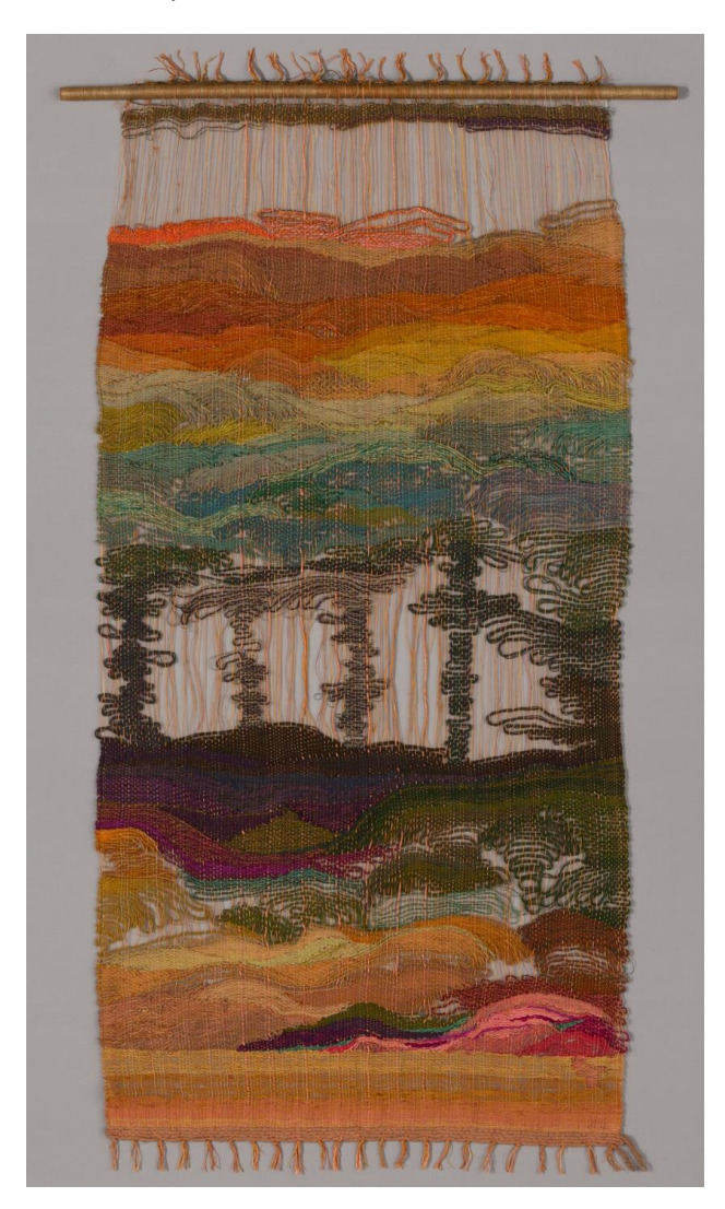
Note. Lenore Tawney. Landscape. 1958. Silk, cotton, bast fibers, and rayon, plain weave with discontinuous wefts and exposed warps; knotted warp fringe over wooden pole wrapped with linen, plain weave. CC0 Public Domain Designation (Tawney)

"The way that her works change the shape—the texture— of a room places new demands on us. They feel partially immersive, which makes us want to both get closer and yet maintain a respectful distance. They emanate intimacy, inspire contemplation, heighten awareness, and increase a sense of presentness , which is exactly what weaving insists upon" [16].