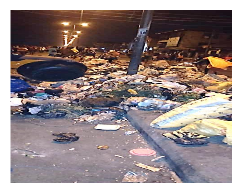
Fig. 3. Dumping of Garbage along Ikwerre Road (Mile 2)