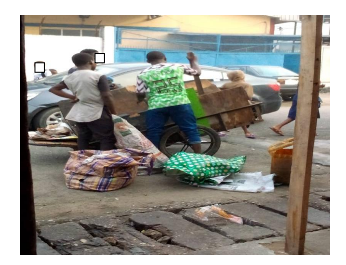
Fig. 2. Method of Garbage Disposal by Households

The identified garbage disposal methods in the studied neighbourhoods are shown and analysed in Table 5. The study revealed that 51% of the respondents disposed of their garbage by dumping them on the roadside. Also, those that dumped their garbage on authorised dumping sites and house-to-house accounted for 27% and 13%, respectively. At the same time, 9% of the respondents dispose of their garbage by burning them. Also, in the garbage disposal, the study found that RIWAMA has contracted the disposal of garbage responsibility to the private firms that collect garbage from the households in the neighbourhoods studied in the municipality.