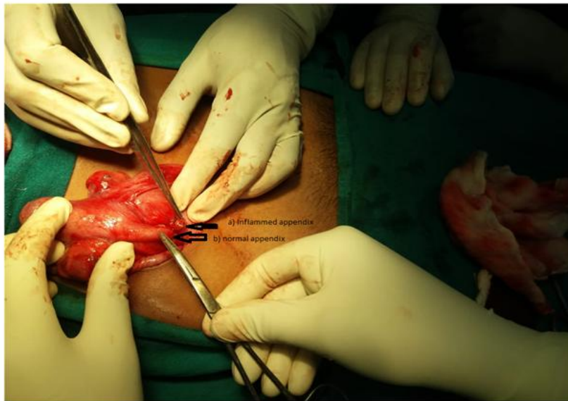
Fig. 1. Intraoperative finding of double appendix a) Inflamed appendix; b) Normal appendix